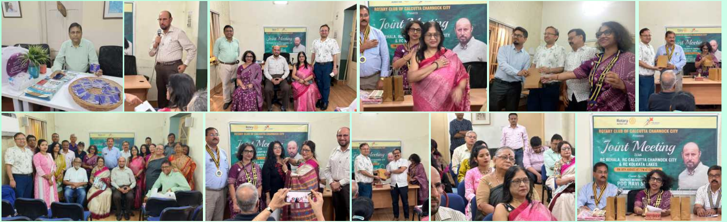
Photos of 509th Regular Meeting on 18th August 2024 at Commune