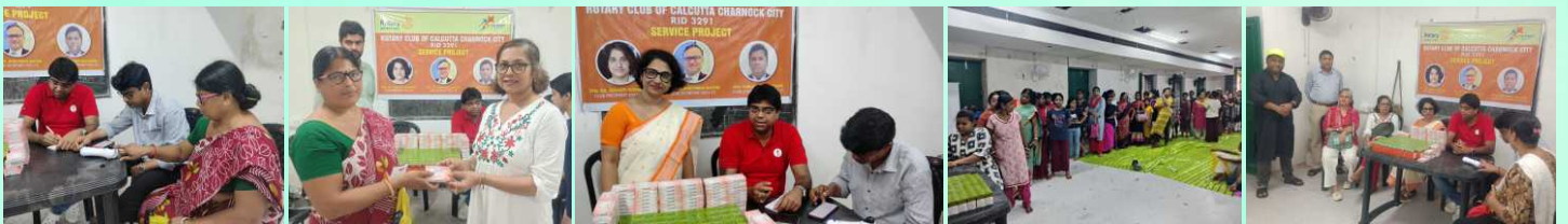
NO NO ANEMIA IN AUGUST