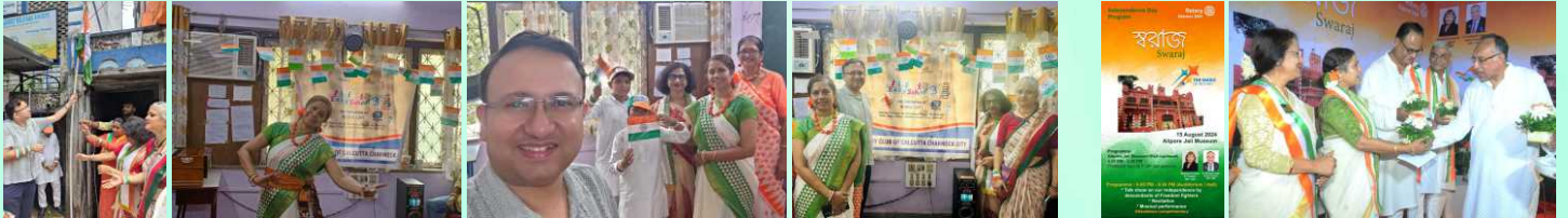
15th August celebration with Special Children, Easy School 3 Project