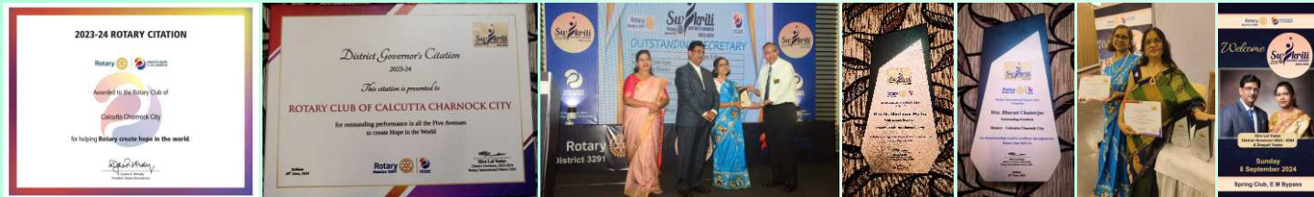
'SWIKRITI'- Award Ceremony of 2023-24