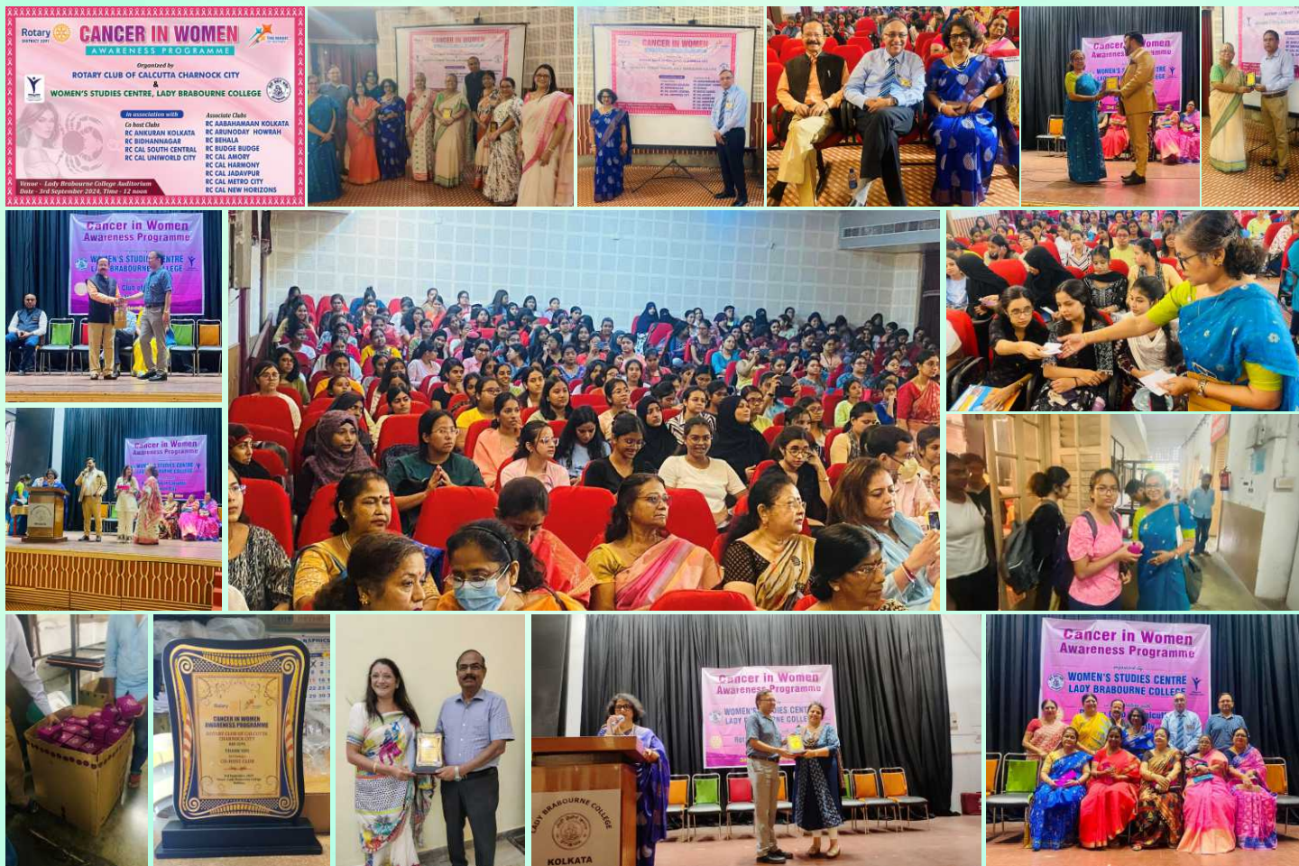
'CANCER IN WOMEN' - 3rd Consecutive Awareness Seminar With Survivors